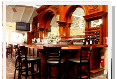
Saturday night après hike watering hole, the M restaurant